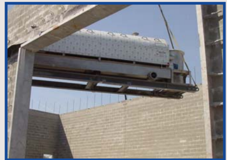
A rotary drum thickener being placed in a new building. (April 2007)