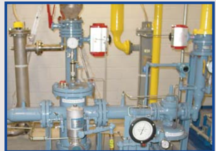
A gas blender in the compressor room will blend digester and natural gases for engine fuel. (April 2007)