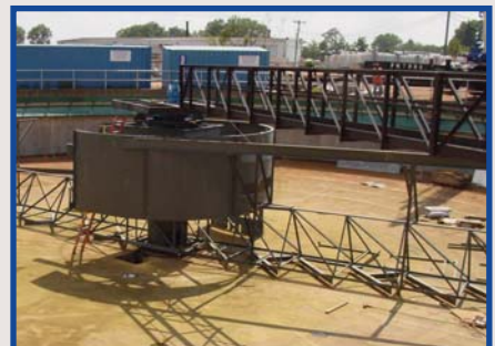
Progress made at settling tank rehabilitation – installation of the center column and sludge collecting arms. (August 2007)